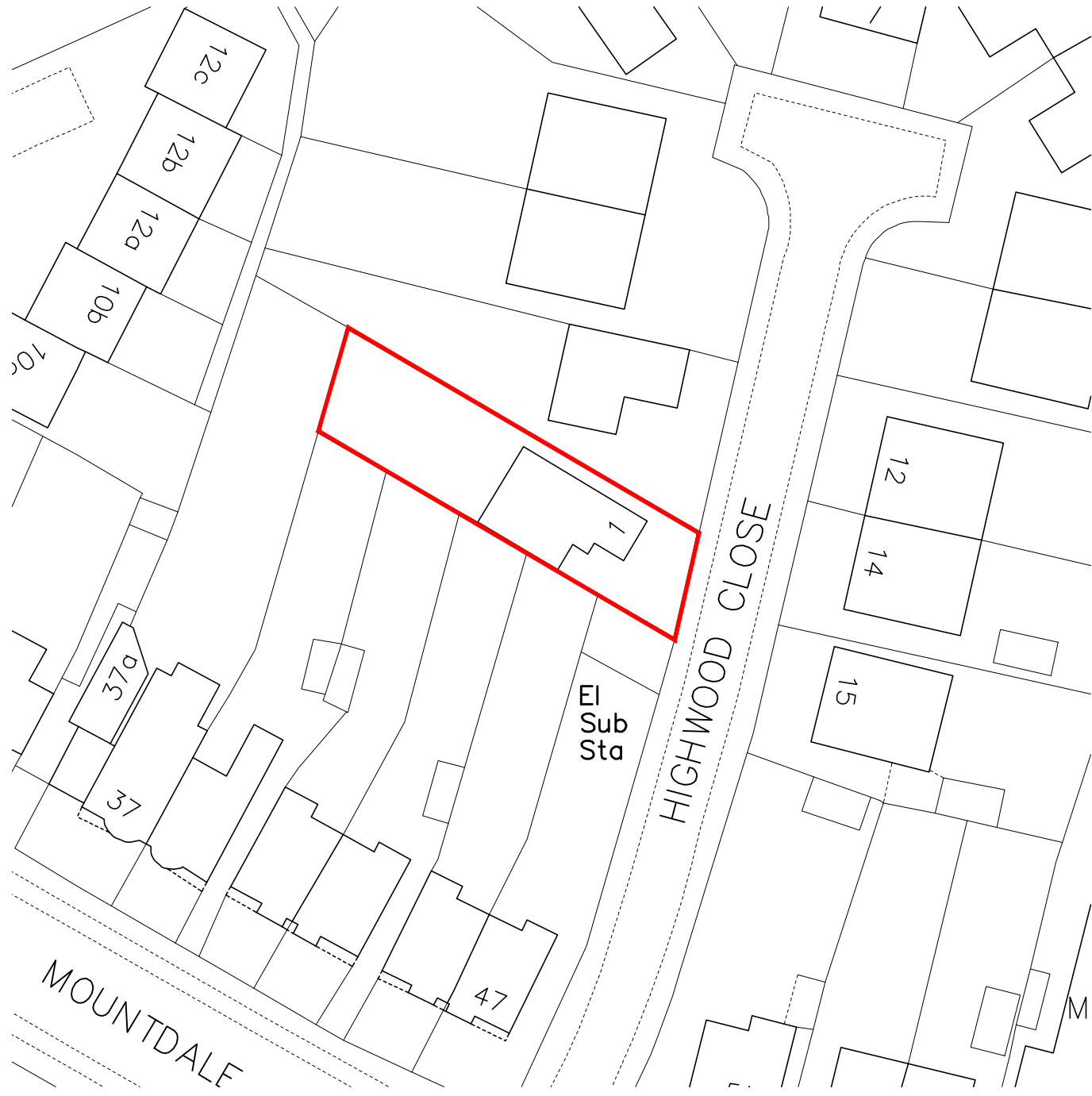
1 Site Plan